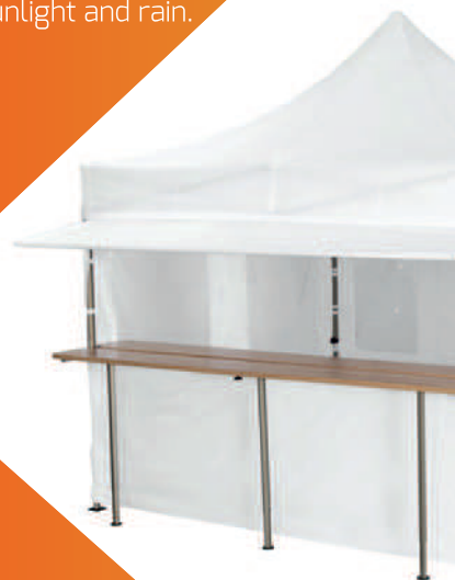
TABLE OF SPECIFICATIONS

Protection from direct sunlight and rain.